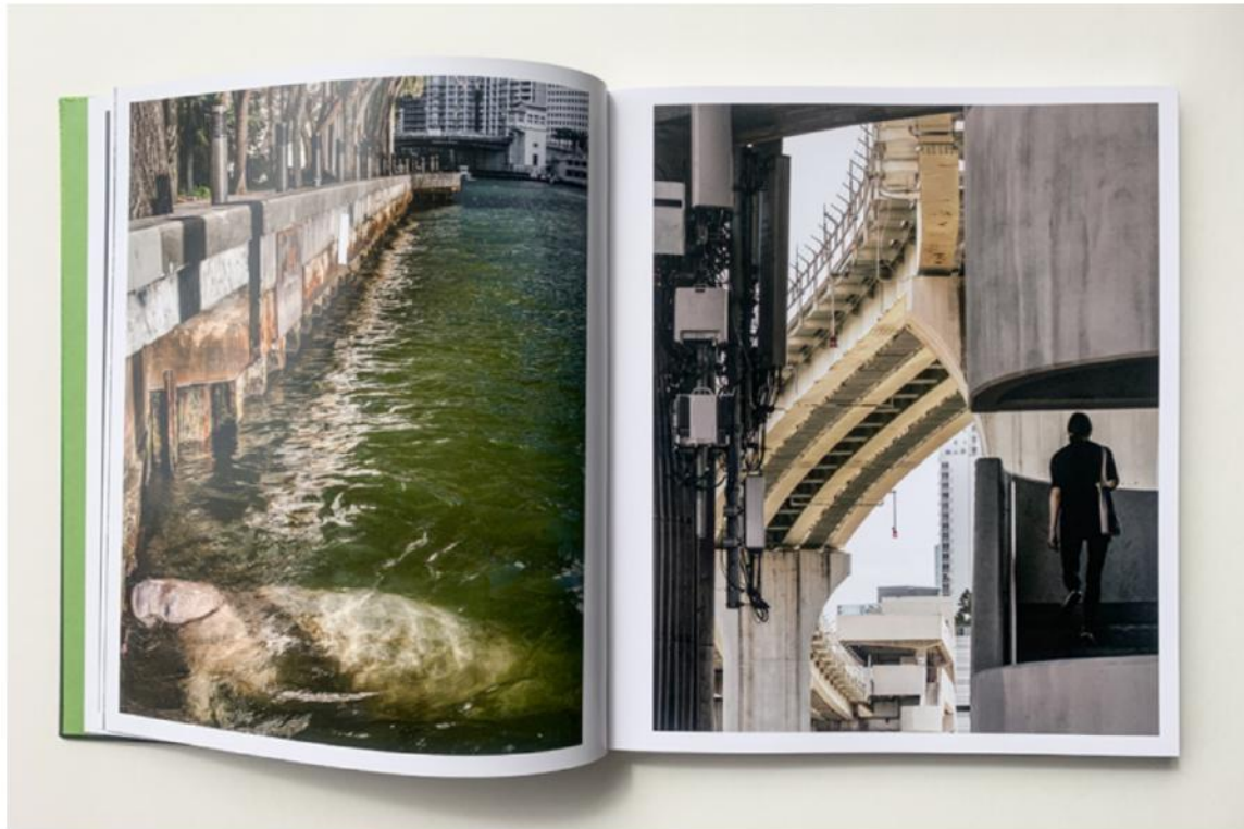
Anastasia Samoylova: Floodzone