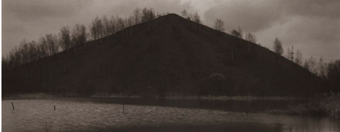
Farciennes (Chemin d'Aiseau), Belgium