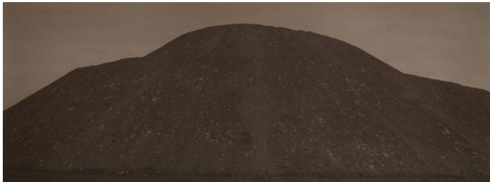
Chelm Śląski I, Poland

68 slagheaps, coal prints, 12×20 inch large format photography. Edition of 5 + 2 artist proofs.